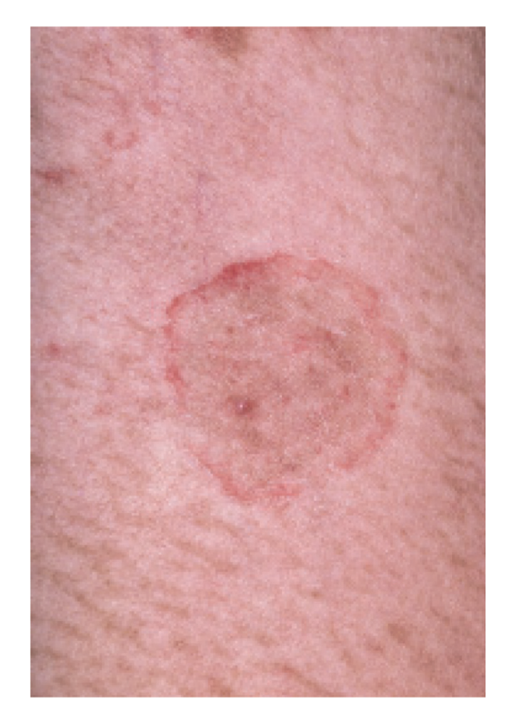
Figure 3.7 Tinea corporis.

Ringworm of the body (tinea corporis) is a fungal infection that occurs as a circular lesion that gradually spreads after beginning as a small red papule. Often there is only one lesion, and the characteristic appearance is of a central cleared area with a red circular advancing edge – hence the name ringworm (Figure 3.7). They are usually acquired through direct contact with an infected person or animal (for example, dogs, cats, guinea pigs and cattle) although indirect contact, such as through clothing, sometimes occurs. Advice should be given to wash towels, clothes and bed linen frequently to eradicate the fungus. Topical imidazoles such as miconazole are effective treatments for ringworm.