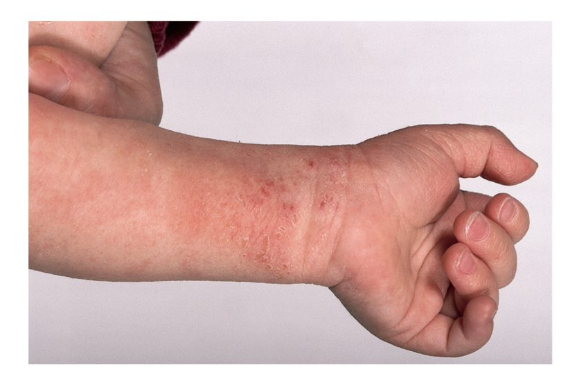
Figure 3.2 Atopic eczema.

These are different from the rash of intertrigo that is caused by a fungal infection and is found in skinfolds or occluded areas such as under the breasts in women and in the groin or armpits.