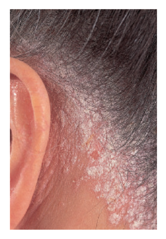
Figure 3.17 Scalp psoriasis.

The psychological impact of having a chronic skin disorder such as psoriasis must not be underestimated. There is still a significant stigma connected with