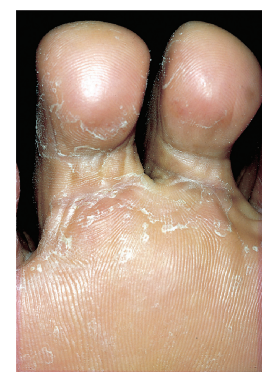
Figure 3.6 Athlete's foot.

Athlete's foot usually presents as itchy, flaky skin in the web spaces between the toes. The flakes or scales of skin become white and macerated and begin to peel off. Underneath the scales, the skin is usually reddened and may be itchy and sore. The skin may be dry and scaly or moist and weeping (see Figure 3.6). Less commonly a 'moccasin type' occurs as well, which is characterised by a more