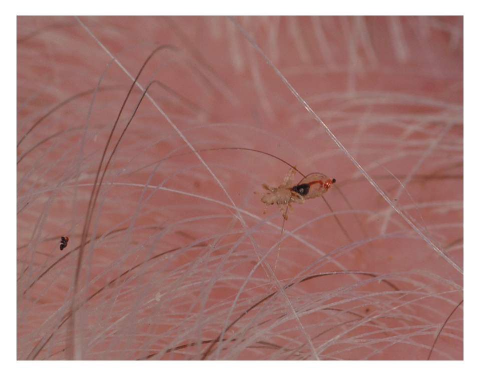
Figure 8.1 This woman had acquired a head louse infection from her grandchild. Source: Weller et al. (2014). Reproduced with permission of Wiley Blackwell.

Unless infection has been confirmed by a health visitor, nurse or doctor who has conducted wet combing of the hair or inspected the scalp, the pharmacist should ask whether any check has been made to confirm the presence of head lice. Live lice should have been seen to warrant treatment (see Figure 8.1); parents often worry that their children may catch lice and want the pharmacist to recommend prophylactic treatment. Insecticides should never be used prophylactically, since this may accelerate resistance. Treatment should be reserved for infected heads.