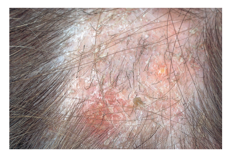
Figure 3.8 Tinea capitis.

Ringworm of the groin (tinea cruris) presents as an itchy red area in the genital region and often spreads to the inside of the thighs. It is thought to be caused by an individual transferring infection from feet (athlete's foot) or nails, by scratching. The problem is seen more in men than in women and is commonly known as 'jock itch' in the United States. People with the infection should be advised not to share towels and to wash them frequently. Wearing loose-fitting clothes made of cotton or a material designed to keep moisture away from the skin, and let things dry out, will also help. Treatment consists of topical antifungals; the use of powder formulations can be particularly valuable because they absorb perspiration.