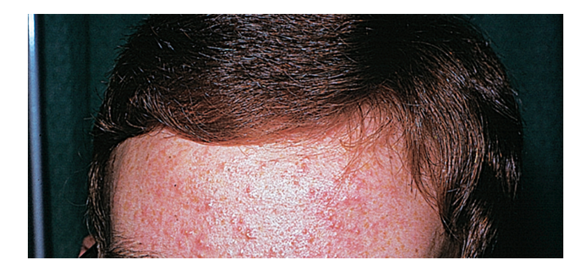
Figure 3.4 The seborrhoea, comedones and scattered inflammatory papules of teenage acne.

nodules and cysts, as well as a preponderance of inflammatory papules and pustules.