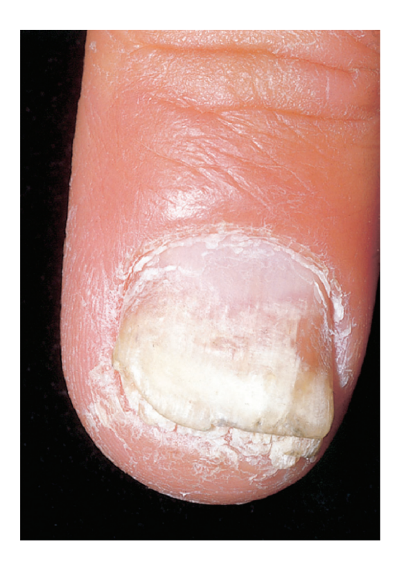
Figure 3.10 Tinea of a fingernail.

problems and immunosuppression. In these instances, oral treatment may be indicated (usually terbinafine).