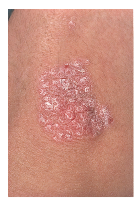
Figure 3.16 Psoriasis vulgaris.

point distinguishes psoriasis from seborrhoeic dermatitis, where the face is often affected.