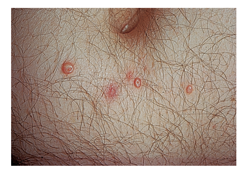
Figure 3.12 An umbilicus surrounded by umbilicated papules of molluscum contagiosum.

Molluscum contagiosum is a condition in which the lesions may resemble warts, but another type of virus is the cause (a pox virus). They are mostly seen in infants and preschool children. The lesions are pinkish or pearly white papules with a central dimple and are up to 5 mm in diameter (see Figure 3.12). They are said to resemble small sea shells stuck on the skin, and the infection easily passes from child to child – contagious (hence the name). The location of molluscum tends to differ from that of warts – the eyelids, face, armpits and trunk may be involved. The lesions are harmless and usually resolve in a few months without scarring. They are best left untreated, but if parents are