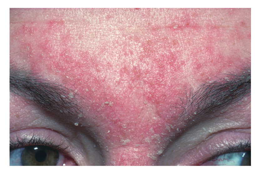
Figure 3.15 Seborrhoeic dermatitis.

Psoriasis can affect the scalp, but other areas are also usually involved. The knees and elbows are common sites, but the face is rarely affected. This latter