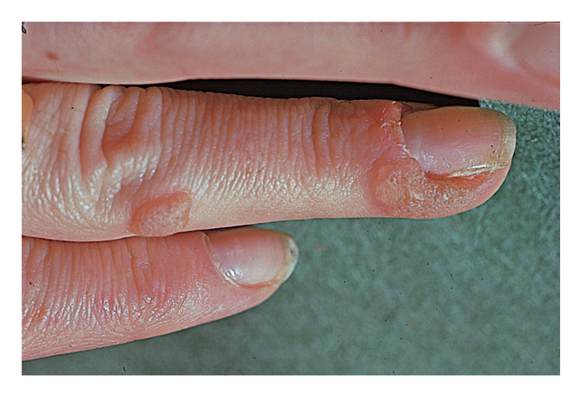
Figure 3.11 Typical common warts on the fingers.

Warts appear as raised fleshy lesions on the skin with a roughened surface (Figure 3.11); the most common type is said to resemble a cauliflower. The appearance can vary, mostly related to where they occur on the body. Verrucae occur on the weight-bearing areas of the sole and heel and have a different appearance from warts because the pressure from the body's weight pushes