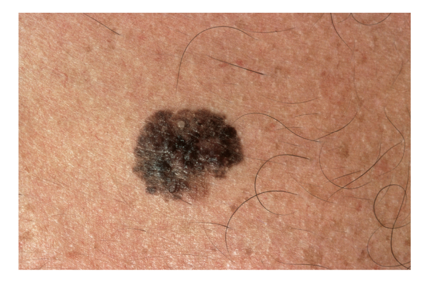
Figure 3.13 Malignant melanoma.

If treatment has not been successful after 3 months and the wart is causing symptoms or upset, referral for consideration of removal using cautery, curetting or liquid nitrogen may be required. Some podiatrists provide these treatments for verrucae. Not all GP surgeries provide cryotherapy.