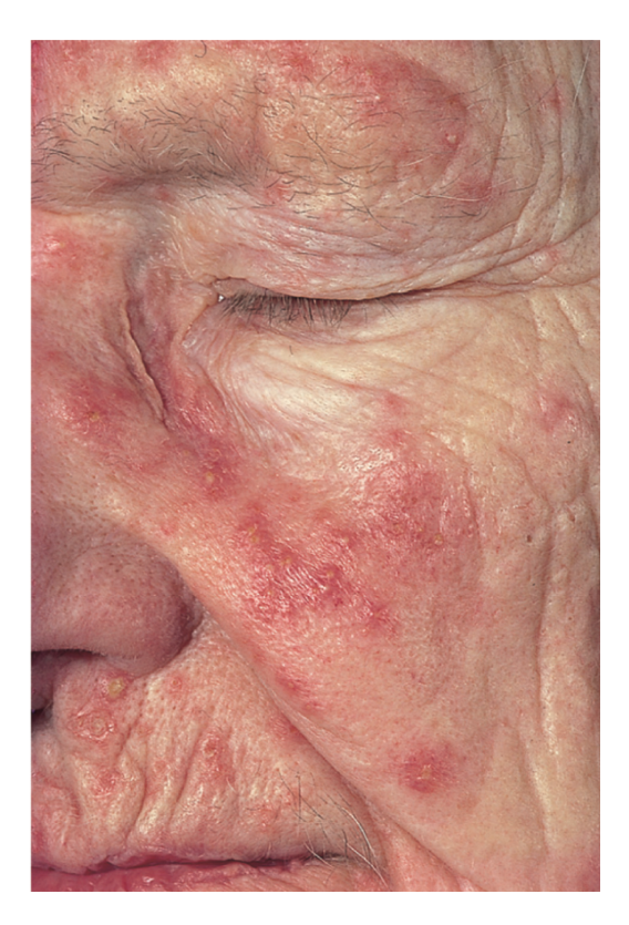
Figure 3.5 Rosacea.

and pustules. It may be associated with recurrent episodes of facial flushing and telangiectasia (broken capillaries).