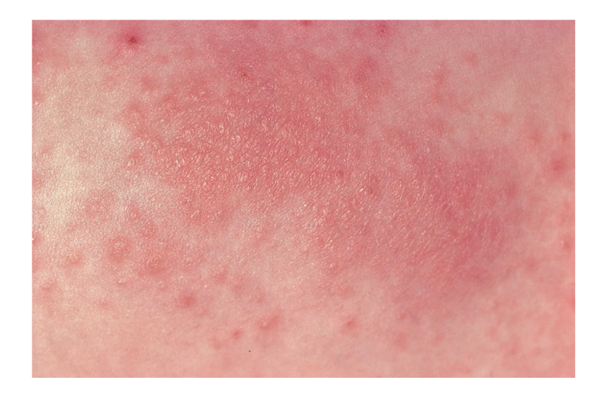
Figure 3.1 Typical eczema dermatitis rash.