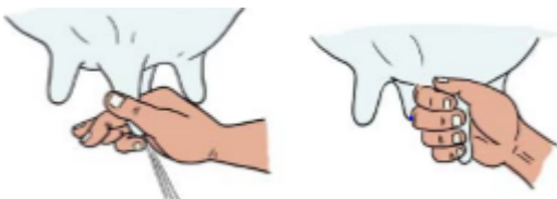
Fig. A. Hand strip

The most common milking technique is ‘hand strip’ milking for the entire milking cycle. But the second hand squeeze method is more closely mimics the natural calf sucking reflex, which seals the top of teat with the lips and squeezes the teat with the tongue.