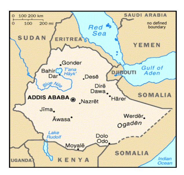
Figure 1 Map of Ethiopia

Ethiopia is located in the Horn of Africa and is the largest country in the continent. It has an area of 1,112,000 km<sup>2</sup> and it has an elevated central plateau varying between 2,000 and 3,000 meters above sea level