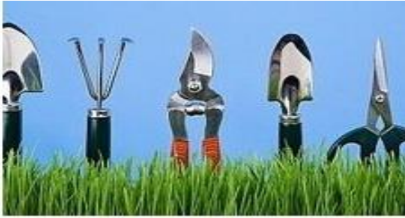
Clean and Store Gardening Tools for the Winter

Putting horticultural tools away properly for the winter can add years to the life of your equipment. Your tools will be protected from rust and wear , and better yet, they'll be ready to go the moment spring fever hits on that first balmy day next year.