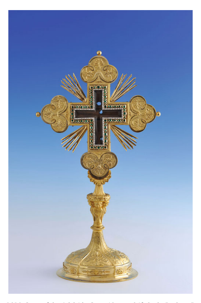
Fig. 3 1810 Copy of the Adelaide Cross

and all that remains of this copy is an engraving of what it looked like from 1734.30 In 1809, the original cross was brought from St. Blaise in the Black Forest to the Abbey of St. Paul in Lavanttal, in Austria (Fig. 3).31 The Abbey of St. Blaise was dissolved in 1809, but the monks were invited