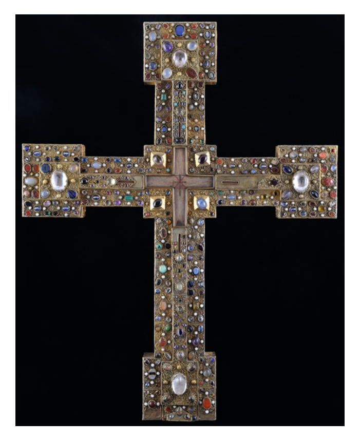
Fig. 1 The Adelaide Cross, front, ca. 1080s

to come.<sup>1</sup> An analysis of the composition of the gemstones on the cross and a comparison with other similar reliquaries will be undertaken as well. Finally, this long-term view will be employed to see how the meanings related to aspects of the reliquary changed over time. In spite of the limited amount of written data on the life of this particular queen, this approach can clearly demonstrate not only Adelaide's own imitation of Hungary's first queen, but also her concern for the promotion of her natal family, particularly their "Roman" or imperial ties. The new questions raised by this approach will aid in understanding issues of gender, memory, and material culture of Central Europe in the Middle Ages.