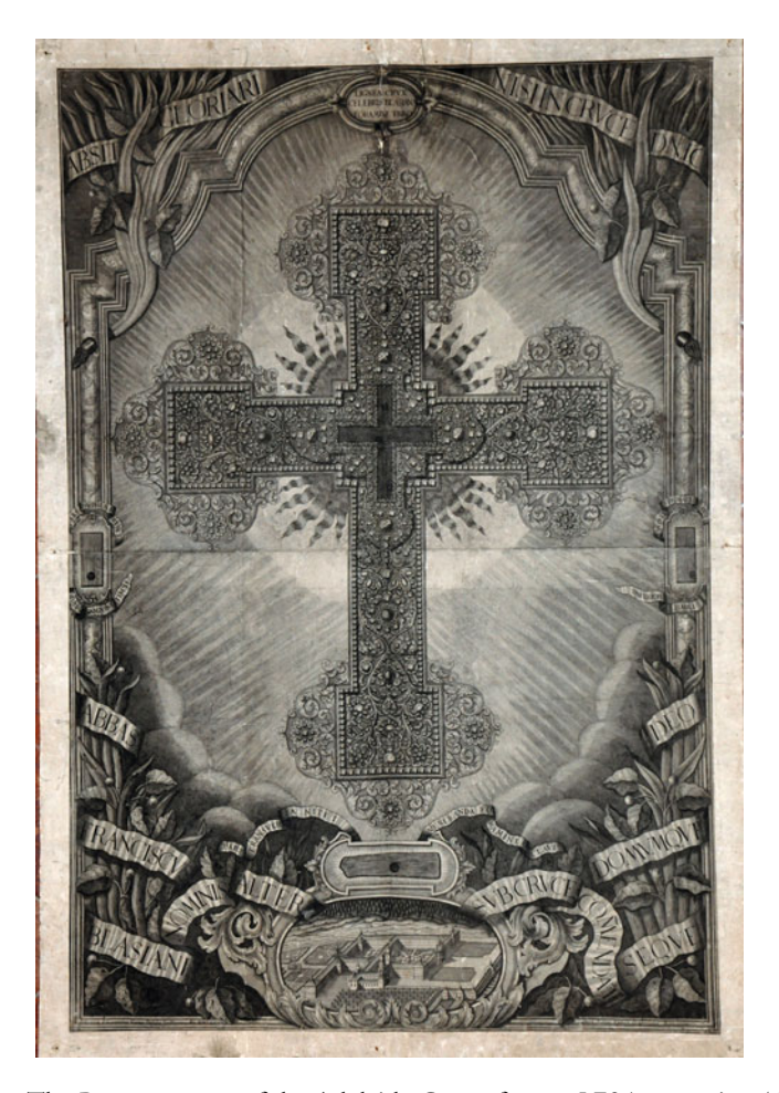
Fig. 2 The Baroque copy of the Adelaide Cross, from a 1734 engraving

In 1688, Abbot Romanus Volger (1672–1695) ordered a new reliquary to be made that was a Baroque copy of the Adelaide Cross (Fig. 2). The particles of the True Cross in the original reliquary were transferred to this new one, but it was destroyed sometime in the Napoleonic Wars