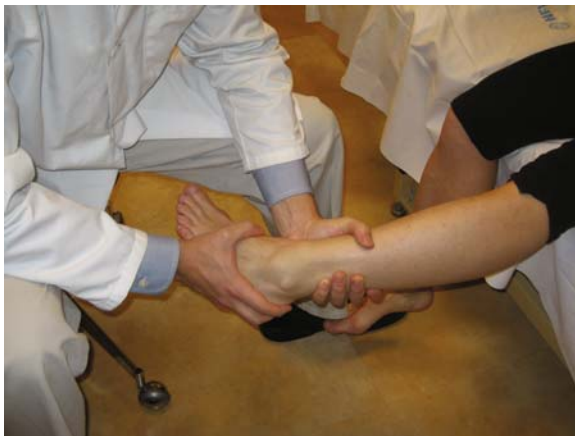
Fig. 11.2 Talar tilt test