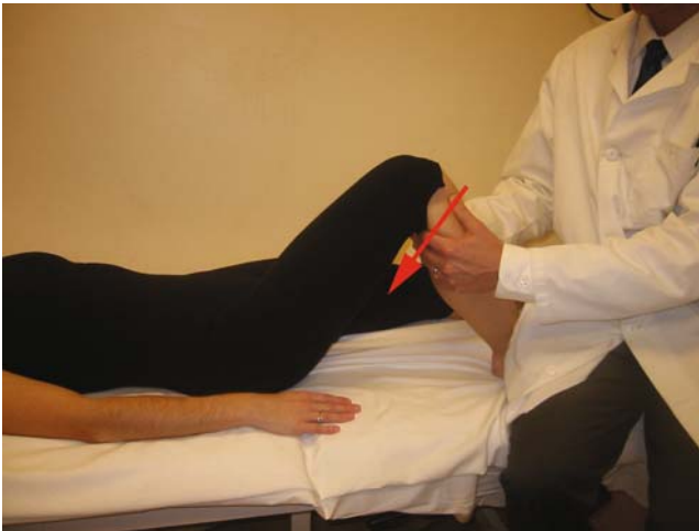
Fig. 10.2 Posterior drawer test