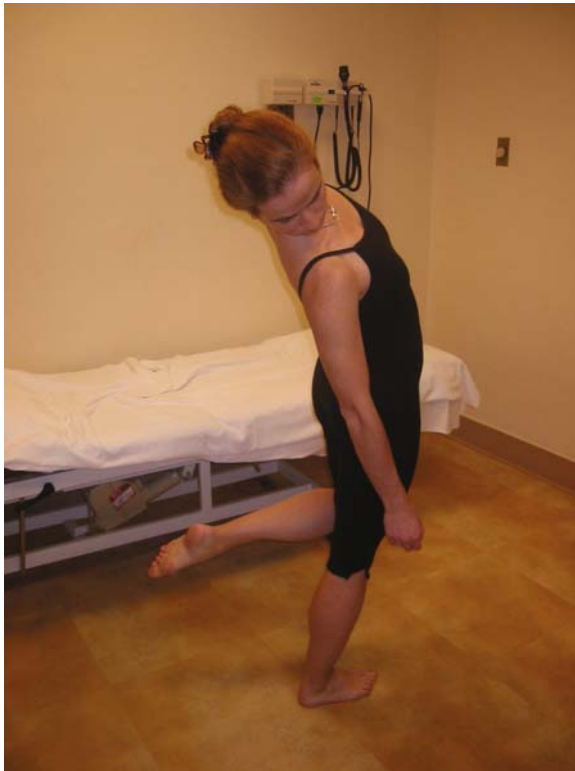
Fig. 8.1 Stork test

Physical examination may not reveal any bony tenderness. Muscle spasms may overlie the affected bony structures. Pain is typically worsened with trunk extension and oblique extension. The single leg hyperextension test (Stork test) is often useful (Fig. 8.1). In this test, if the patient has right sided back pain, he or she stands on the right leg and leans in lumbar oblique extension over the right leg. This is