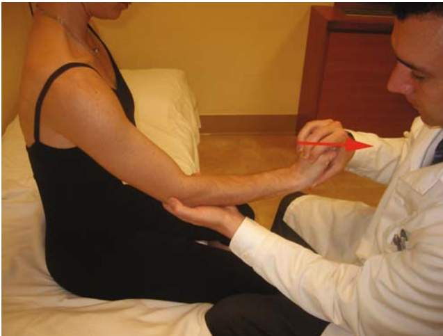
Fig. 6.1 Cozen's test

Diagnosis is based primarily on physical exam and history. Pain is elicited on palpation of the lateral epicondyle, and is aggravated by wrist extension and radial deviation. In Cozen's test (Fig. 6.1) the patient extends the wrist against resistance that is provided by the examiner at the same time as the examiner palpates the lateral epicondyle. In lateral epicondylitis, this will be very painful. In more severe cases, decreased grip strength can be noted. MRI or ultrasound can be used for diagnosis, but is usually reserved for patients who fail conservative therapy.