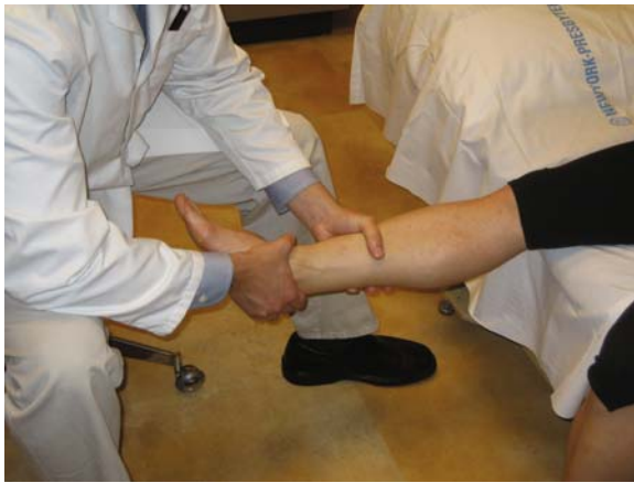
Fig. 11.1 Anterior drawer test