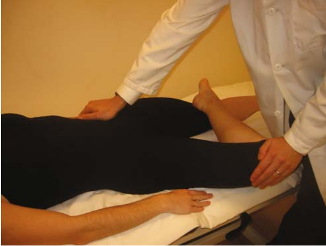
Fig. 8.3 FABERE test