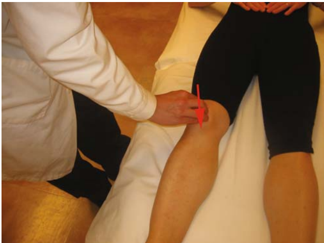
Fig. 10.3 Patella inhibition test

Diagnostic studies are usually normal. Lateral plain films may show the presence of patella alta or patella baja. Sunrise or merchant's view permits better visualization of the patellofemoral articulation. Dynamic CAT scan is useful to assess patellar tacking in difficult cases. Arthroscopy is the procedure of choice for persistent symptoms despite conservative management.