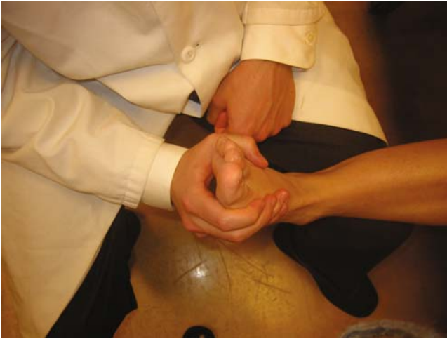
Fig. 11.3 Tarsal compression test

and shoes with stiff soles can help in treating and preventing injury recurrence in these patients. Surgical referral for unstable and displaced intra-articular injuries is appropriate, although surgical intervention is rarely required (Table 11.4).