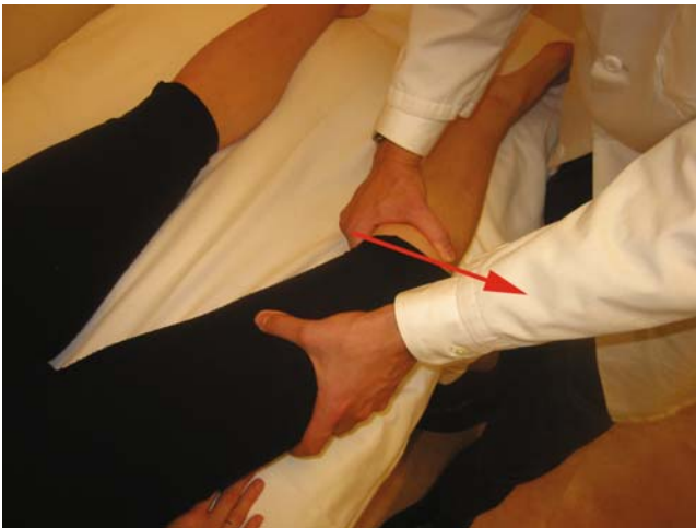
Fig. 10.1 Lachman test

Diagnostic studies are useful for establishing a diagnosis. Anteroposterior and lateral radiographs are usually negative but may reveal an associated avulsion fracture. MRI is highly sensitive and specific, and should be considered in difficult