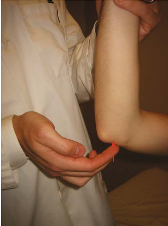
Fig. 6.3 Ulnar nerve palpation at the elbow