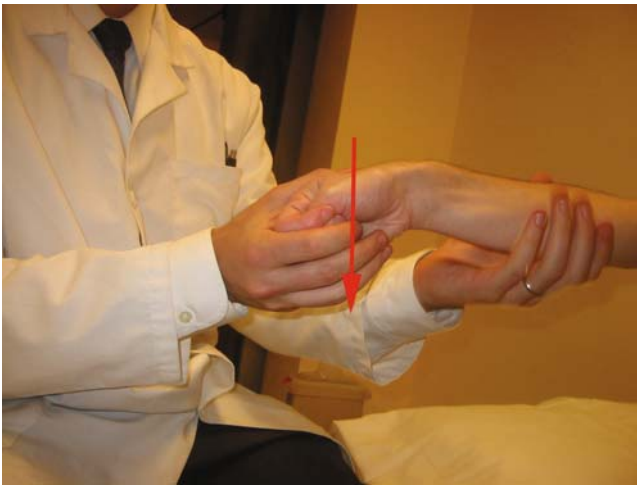
Fig. 7.1 Finkelstein's test

Noninvasive methods of treatment include application of ice at the radial styloid and the use of a dorsal hood splint or thumb spica splint. The available evidence shows that steroid injection is the most effective treatment, with about 70% of