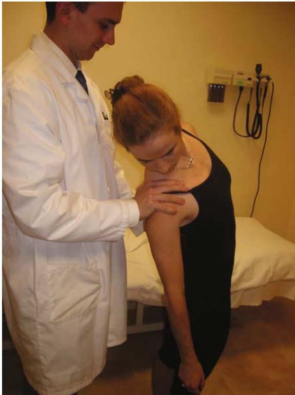
Fig. 8.4 Lumbar oblique extension

On physical examination, the patient will often have pain that is worse with trunk extension and oblique extension (Fig. 8.4). The Stork test may be positive. If a nerve root is impinged, findings of radiculopathy may be present. Otherwise, the neurological examination should be normal.