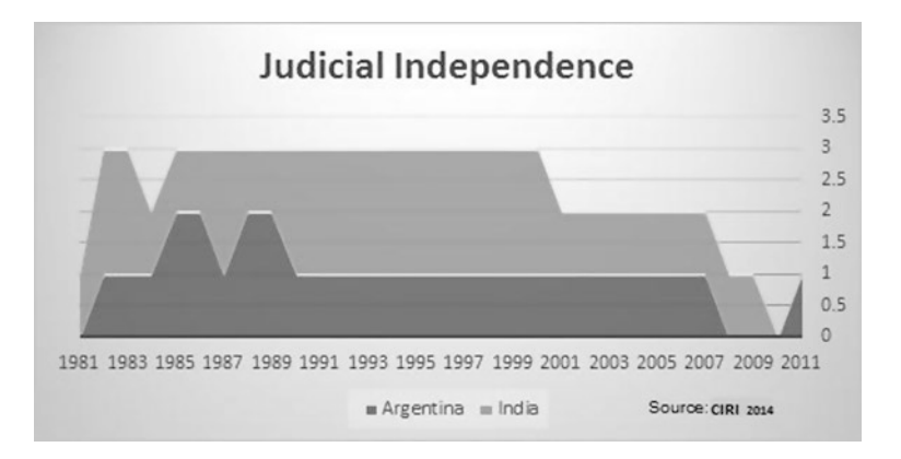
Fig. 3.1 Judicial independence in Argentina and India

police and judicial custody appear in an annual report of NHRC. This directive has led to the creation of an archive on custodial deaths but not to the decline in the cases, as discussed below. The 1990s also saw the creation of a custodial jurisprudence on torture and custodial deaths that highlighted the continuing challenge for the judiciary of how to address the question of torture.