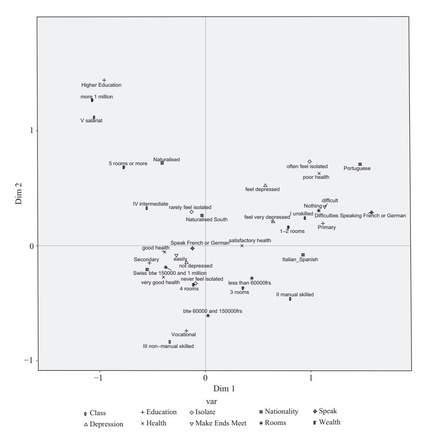
Fig. 4.1 MCA. Map of variables. Variances of Dim. 1 (12.33%) and Dim. 2 (6.48%)

quality of life as the Naturalized and the Swiss citizens. Portuguese are most heavily concentrated in the upper right quadrant of the figure and the Spanish/Italians in the lower right quadrant, with some overlap in the lower left quadrant. The map of individuals shows clearly the social stratification between elderly migrants and Swiss citizens. Portuguese are clearly the most deprived group.