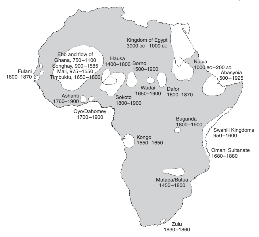
Map 2.1 Selected pre-colonial African states

Some of these grand civilisations were in advance, technically and socially, of their European contemporaries, but the fascinating details of these states, given the particular focus of this book, will have be left to the historians. The task of this chapter is to extract relevant aspects of history that help to explain African politics today. The factors of continuity that stand out above all the others, in this respect, are the issues of non-hegemonic states and lineage.