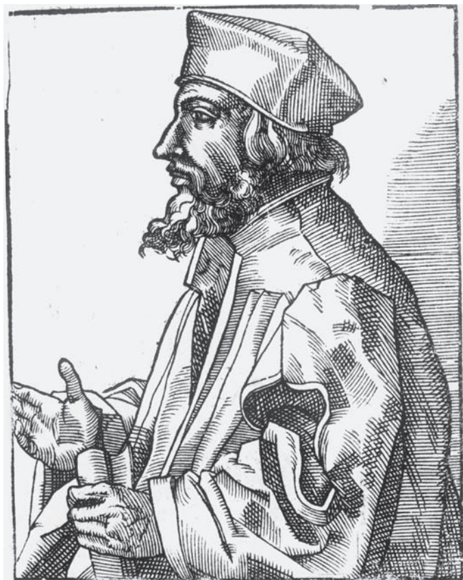
Plate 6 Jan Hus, woodcut portrait