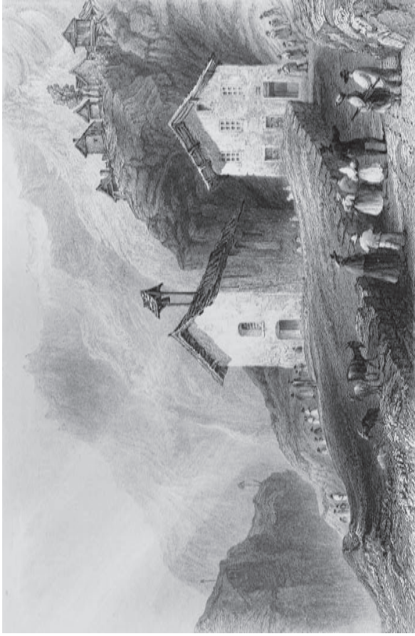
Plate 4 Waldensian community of Dormillouse in the French Alps, engraving from William Beattie, The Waldenses, or Protestant valleys of Piedmont, Dauphiny and the Ban de la Roche (London, 1838). British Library, London.