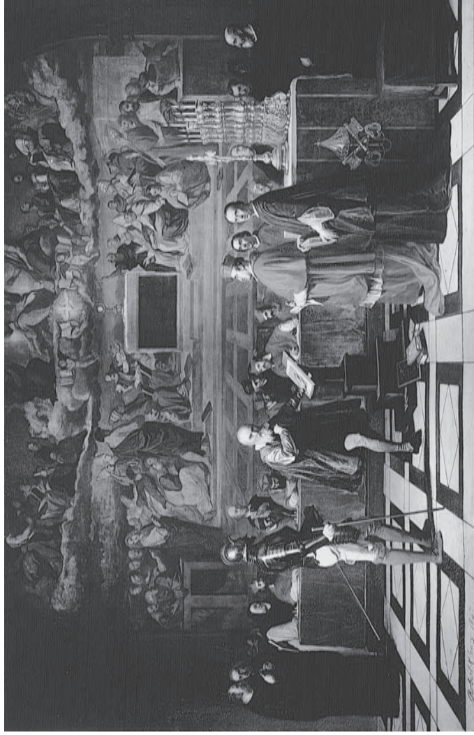
Plate 8 Galileo before the Inquisition, Rome, 1633, painting by J. N. R. Fleury. Musée du Louvre, Paris/photo AKG London, Erich Lessing.