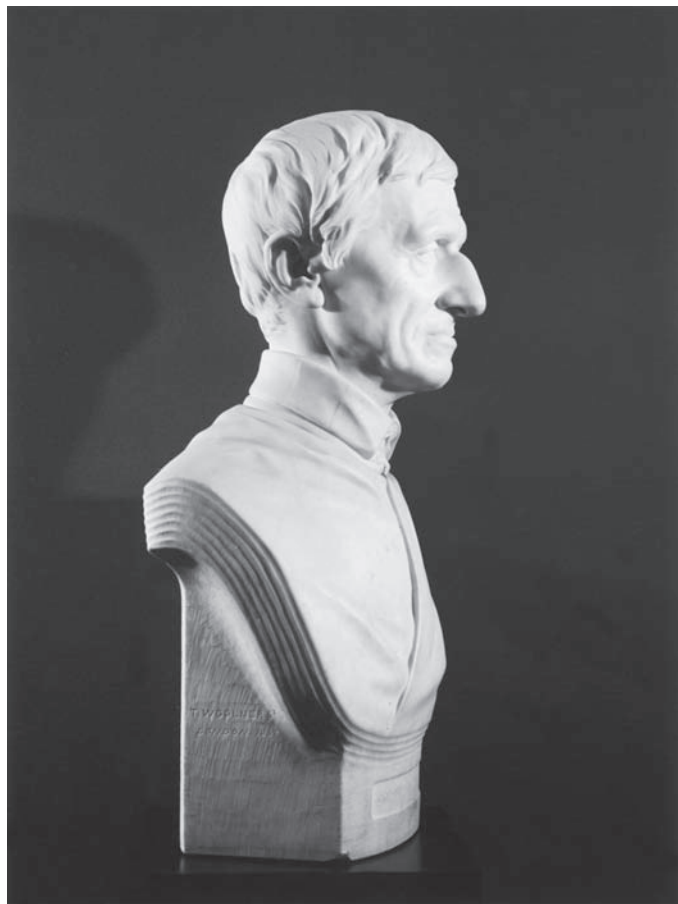
Plate 3 John Henry Newman, portrait bust by Thomas Woolner, 1867.