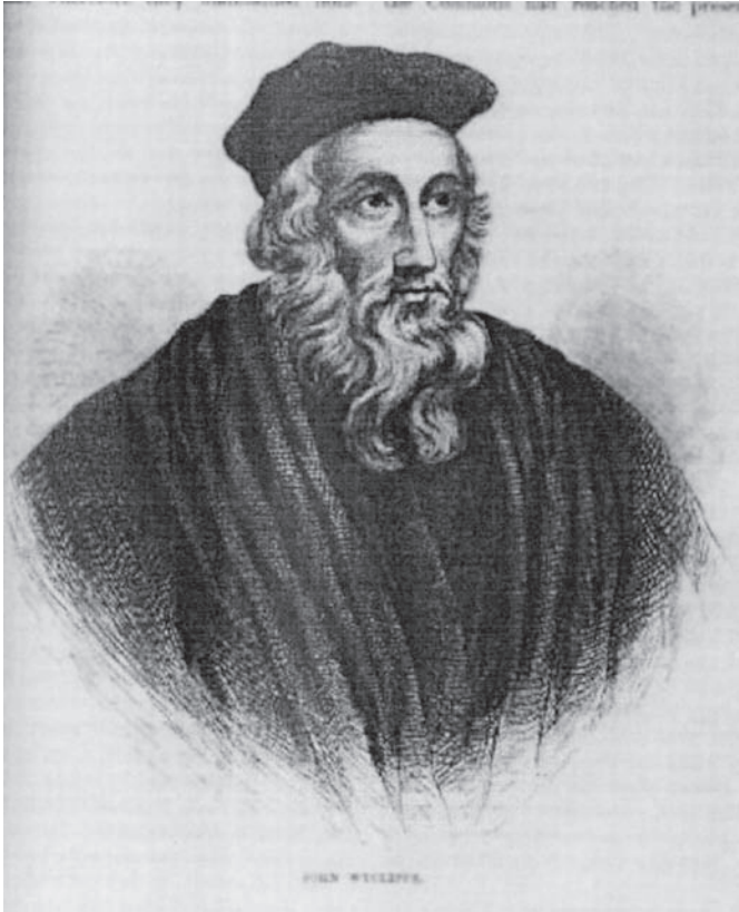
Plate 5 John Wycliffe. Private collection.