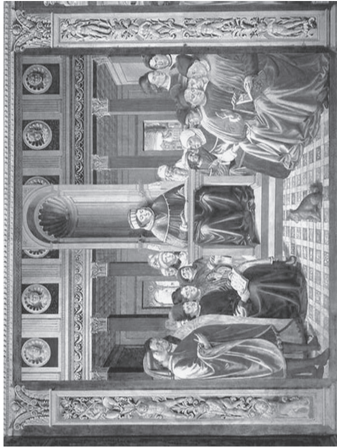
Plate 2 St Augustine teaching in Rome, fresco by Benozzo Gozzoli, 1464-5. Sant'Agostino, San Gimignano/photo SCALA.