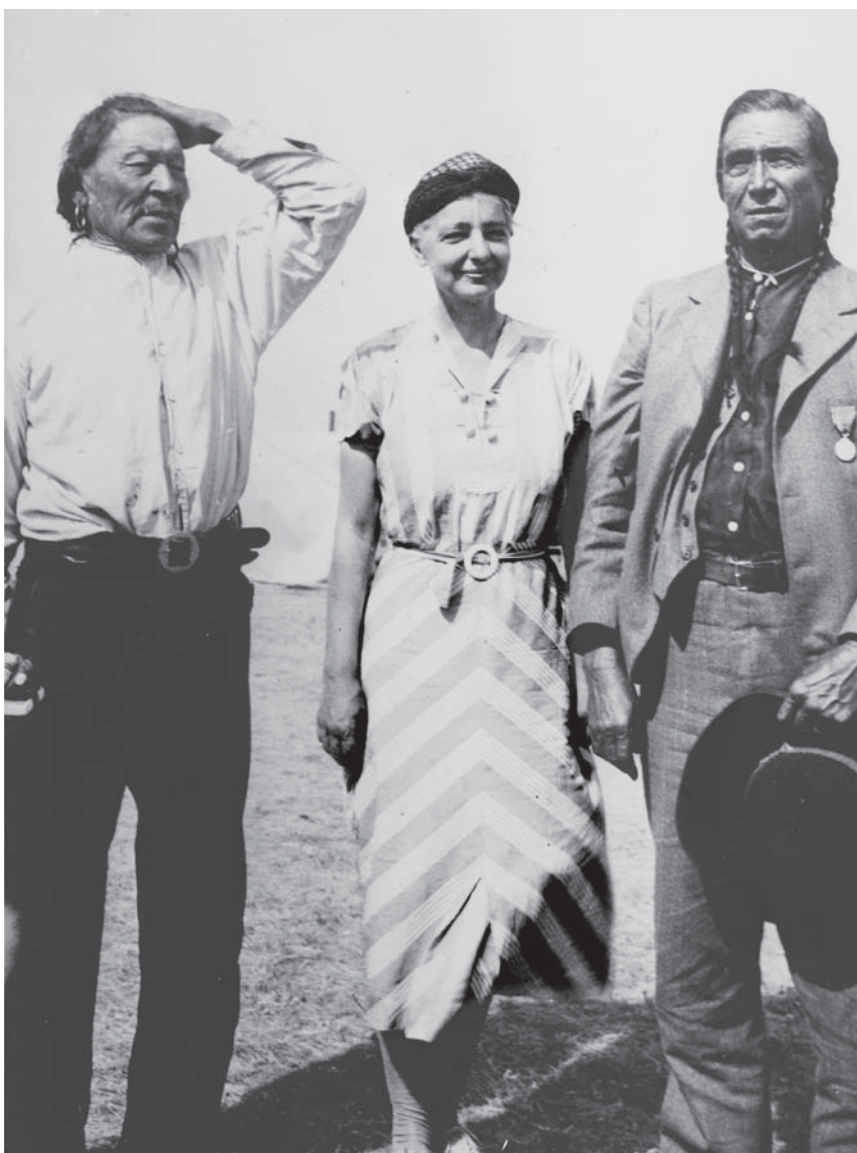
Ruth Benedict in the American Southwest in the 1930s. Courtesy of the National Anthropological Archives, Smithsonian Institution (86-1323).