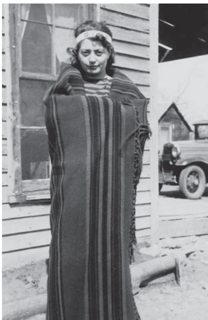
Ruth Landes in Potawatomi cloak, circa 1935. Courtesy of National Anthropological Archives, Smithsonian Institution (91-4_732).