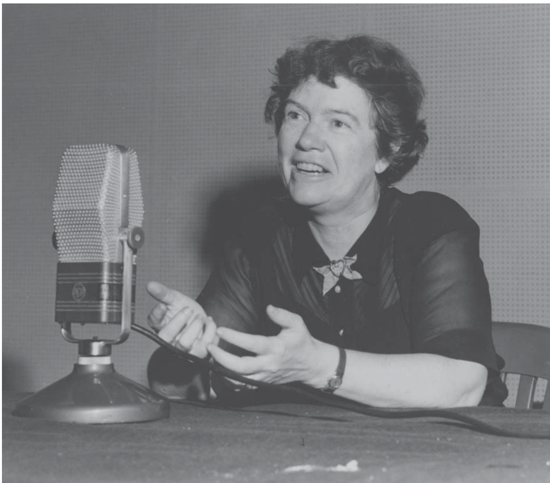
Margaret Mead.