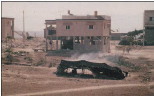
Figure 5.2b. Building the home, while dwelling in the tent.