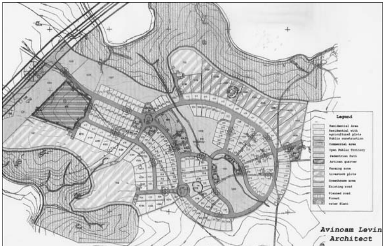
Figure 7.1 Design of a rural settlement for the Tarabin as-Sane' (Be'er-Sheva Valley, Israel).