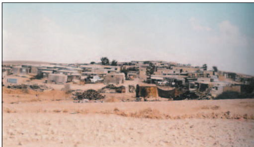
Figure 5.2a. A spontaneous settlement.