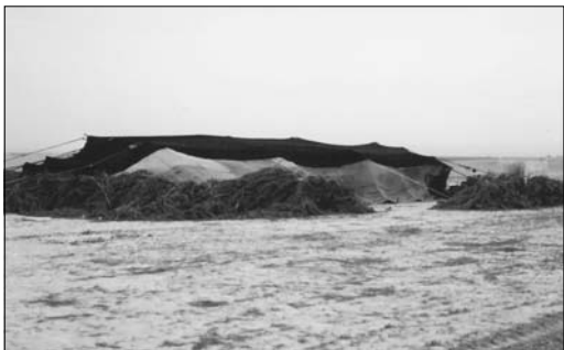
Figure 6.1b. Heaps of pine branches pruned in the Yatir Forest to be used for firewood.

A number of research papers: Bruins (1986), Evenari et al. (1971), Droppelmann et al. (2000), and Droppelmann and Berliner (2000), indicate the present-day potential of wadi areas to sustain agriculture when they benefit from run-off systems and annual flooding. This is so despite the ongoing Holocene and the diminishing precipitation rates, that were probably somewhat greater during the Byzantine era. Reconstruction of Nabatean-Byzantine systems by Prof. Evenari near Avdat, and archeological excavations in other places in the Negev Highlands and eastern Sinai, have provided the basis for measurement of the runoff water potential. The Nevo excavations (1991: p. 47 ff.), which also included plots on wadi slopes on which flood banks and stone terraces have been built, suggest that the ancient terracing method was used not only for farming, but also as part of a local tradition for the cult of spiritual entities. Nevo investigated the properties of the remains of these terraces from the late period of the permanent settlement in the Negev Highlands, which ended about 100 years after the Arab conquest. The upshot of the research is that the area could not provide food for a large population. The towns and villages of the Negev Highlands required massive assistance from the Byzantine central authorities and, after the latter's retreat from the Levant during the short interim from the middle of the seventh century until the last