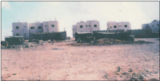
Figure 5.1c. Shacks of families who are constructing homes.