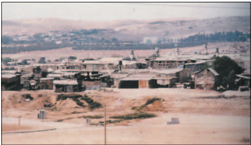
Figure 5.1d. Spontaneous settlement on the outskirts of a township (which can be seen in the distance).

an increase during the later years with the result that although the trend of settlement in towns continued, it did not keep pace with the massive demographic growth. The slowdown in the country's economy following Rabin's death and the new elections which brought the Netanyahu administration to power occasioned severe unemployment in the Bedouin sector and this diminished the settlers' ability to repay loans received for constructing their homes. Moreover, city taxes, in addition to income and