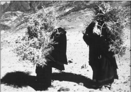
Figure 6.1a. Indigenous vegetation gathered for firewood.