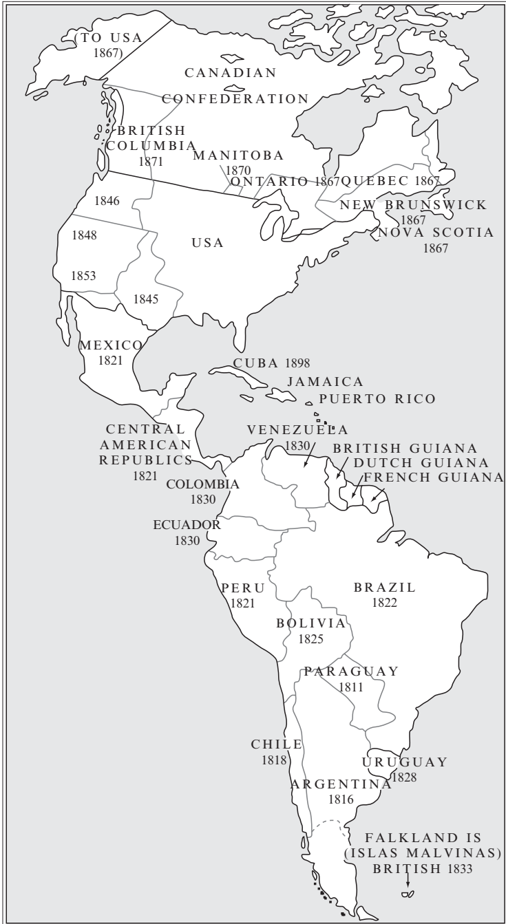
Map 1 Nineteenth-century America (based on Barraclough 1992: 101)