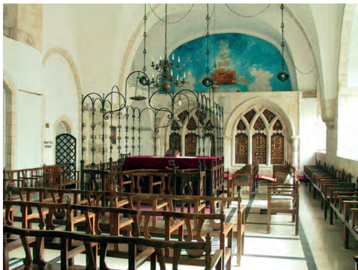
Sephardi Synagogue restored interior