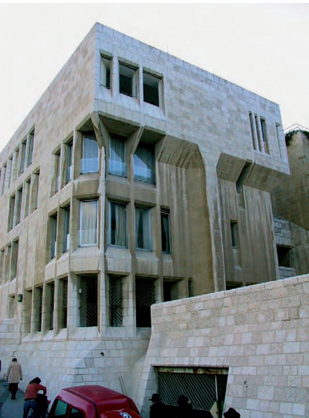
Nebenzahl House