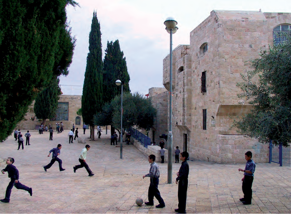
Orthodox children playing football