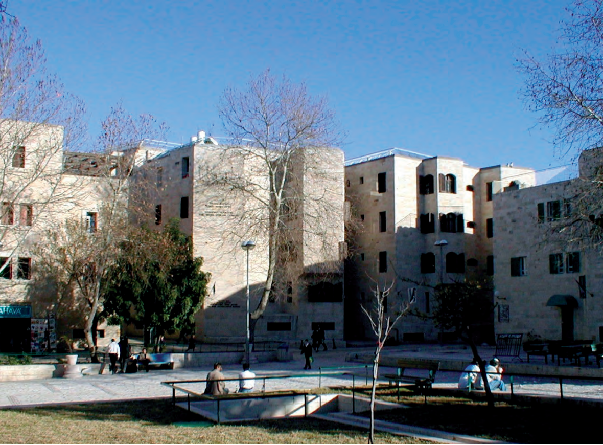
Jewish Quarter Square (Ricca 2002)