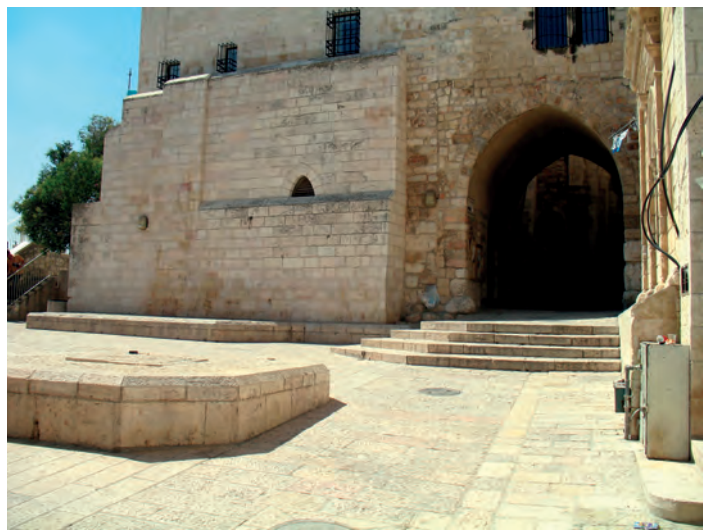
Structural Consolidation