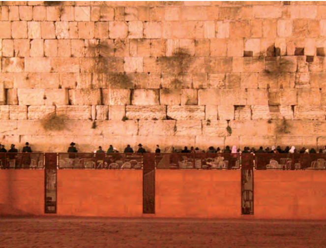
The Wailing Wall