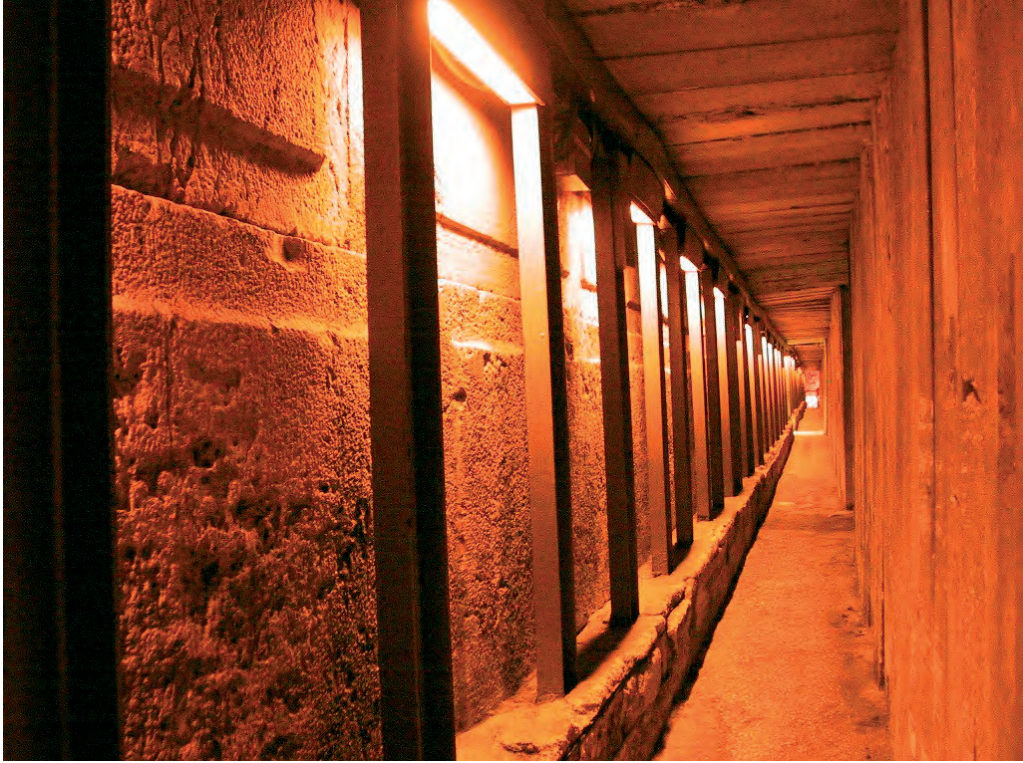
The 'Tunnel'