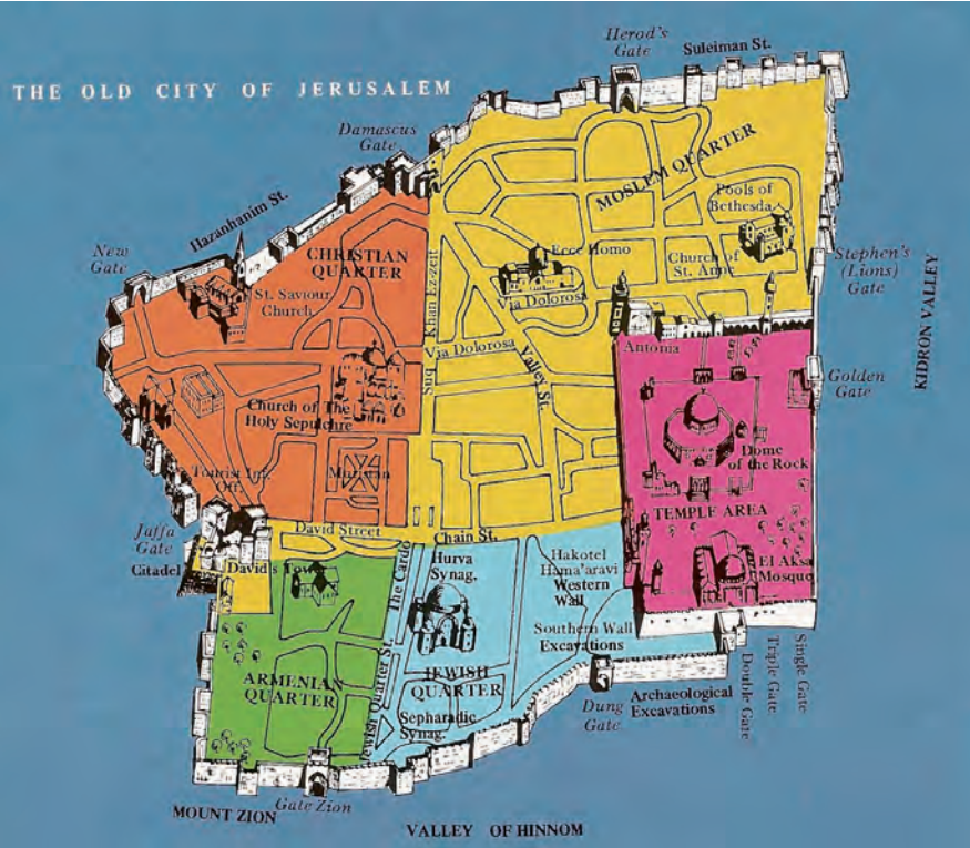
Plan of the 'four quarters' of the Old City of Jerusalem