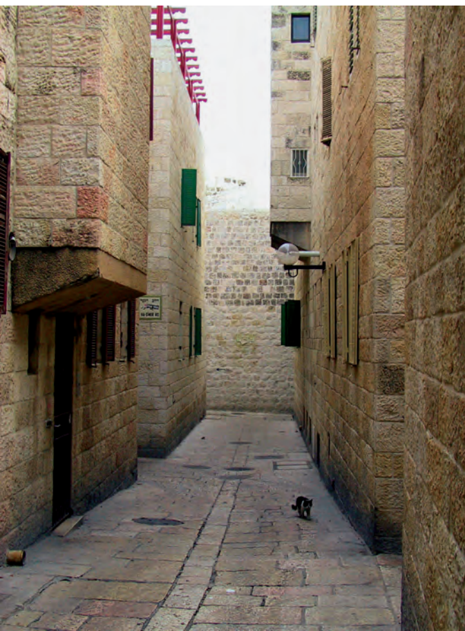
Jewish Quarter street