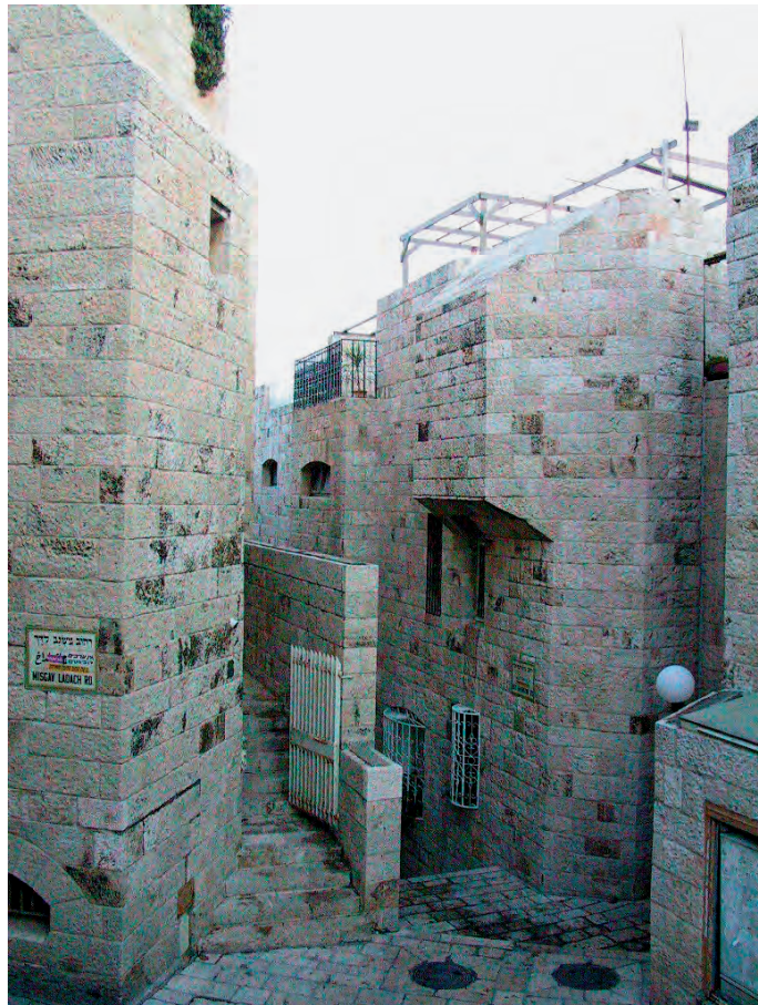
Example of Jewish Quarter architecture