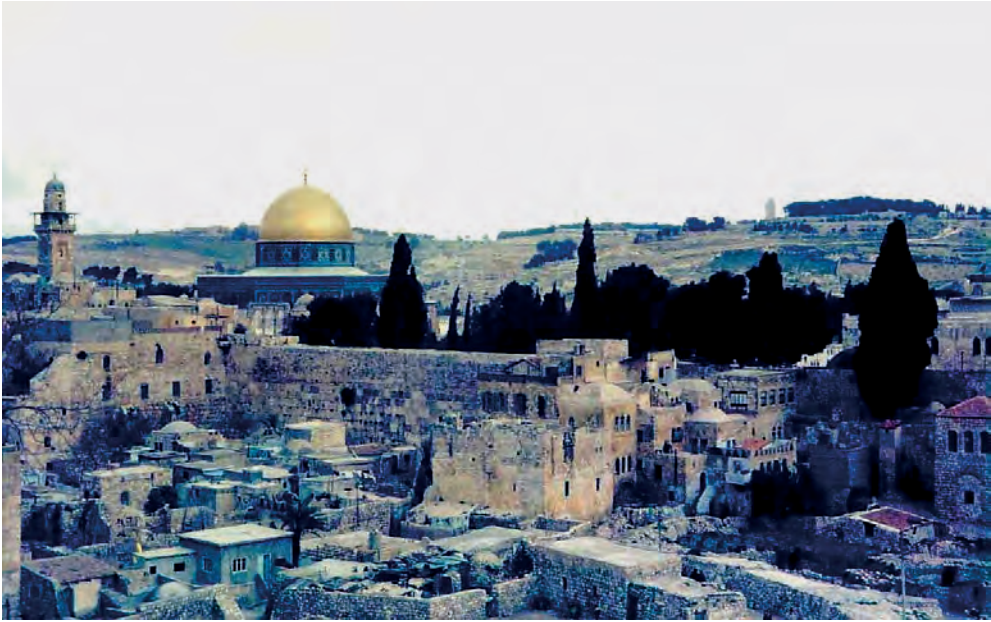
The Moroccan Quarter before demolition (circa 1966)