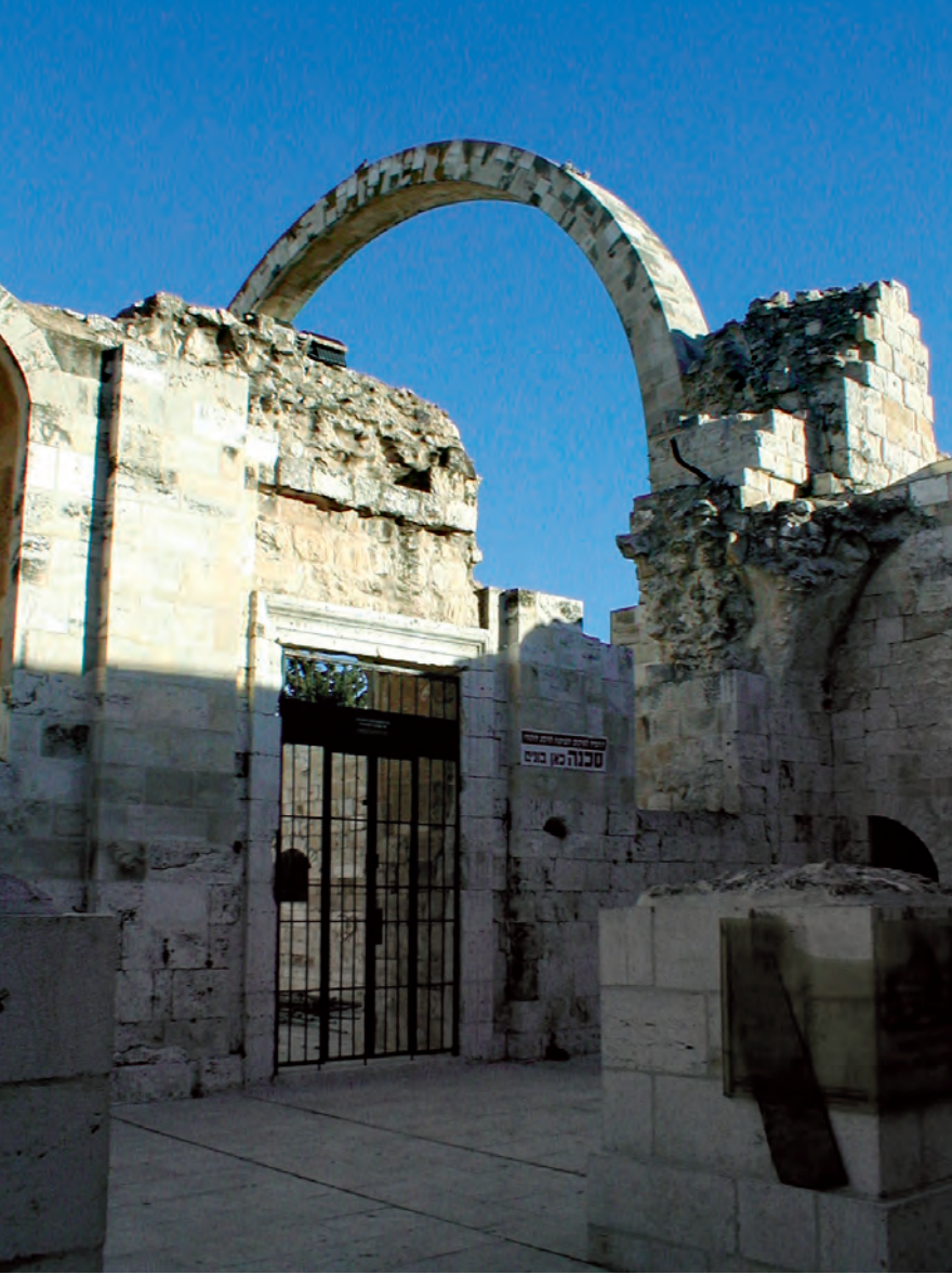
The ruins of the Hurva synagogue