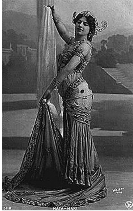
Figure 9.3 Mata Hari, photograph c. 1910. Picture from Kitty's collection. Digital inkjet print, 10" x 8".