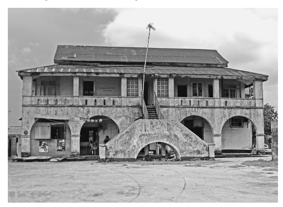
Figure 5.4 Decaying former District Officer's residence