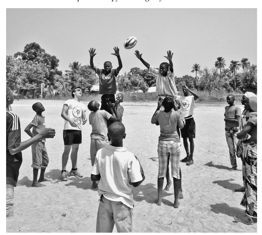
Figure 6.2 F4P in action at Kartong football pitch