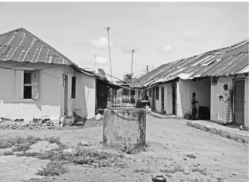
Figures 5.6a and 5.6b Brazilian Baracoon, 1840