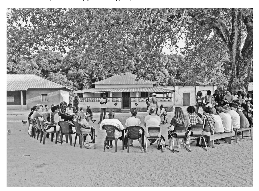
Figure 6.1 Sharing indigenous knowledge at Tumani Tenda Community Camp

and sport officials. In December 2014, during the second coaching camp, with Kartong as the focal point of the initiative, the operation was extended to three other villages – Berending, Gunjur and Medina Salam. The scale of the operation had now increased to fifteen UoB students, one alumnus, four members of partner organisations (from Northern Ireland and Ghana) and twenty-one local participants. Building on the success of the previous camps, at the time of writing, plans to run a third coaching camp are in place. F4P Gambia has so far become a biannual added-value experience offered to all UoB students and members of the School of Sport and Service Management's partner organisations. The overall intention is to expand operations by using The Gambia as a training hub and increase sports coaching capacity in West Africa.