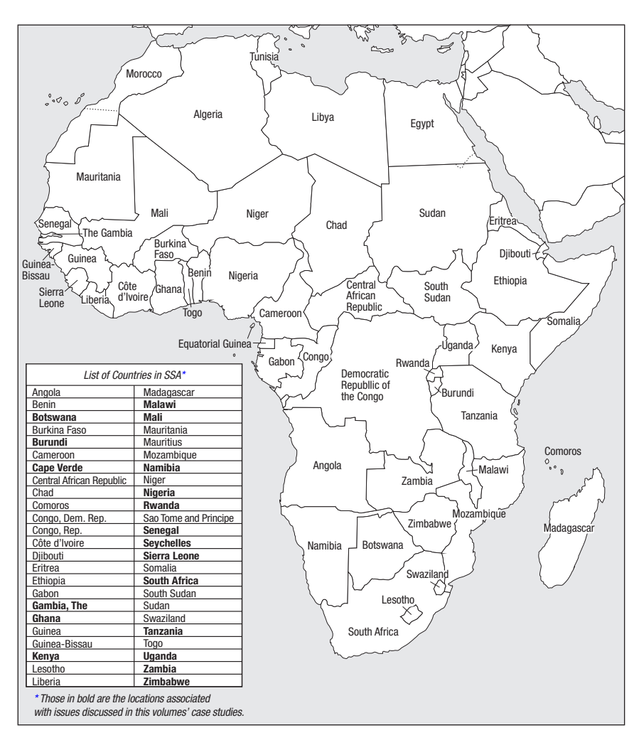
Figure 1.1 Map of sub-Saharan Africa and list of sub-Saharan Africa countries

will be specifically addressed in the chapters that follow. Five case studies introduce the experiences of 'local voices' from Uganda, Namibia, Cape Verde and two from South Africa, providing some interesting insights on aspects associated with tourism and development in these four destinations.