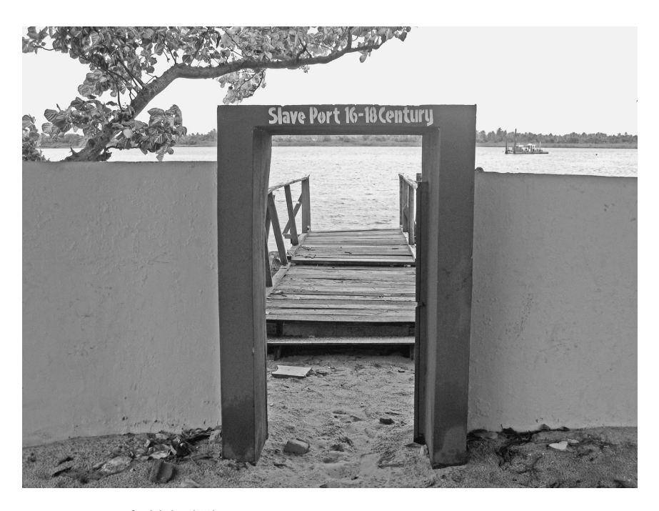
Figure 5.2 Refurbished Slave Port gate