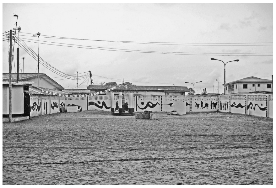
Figures 5.3a and 5.3b Slave market – restructured ground used for local events