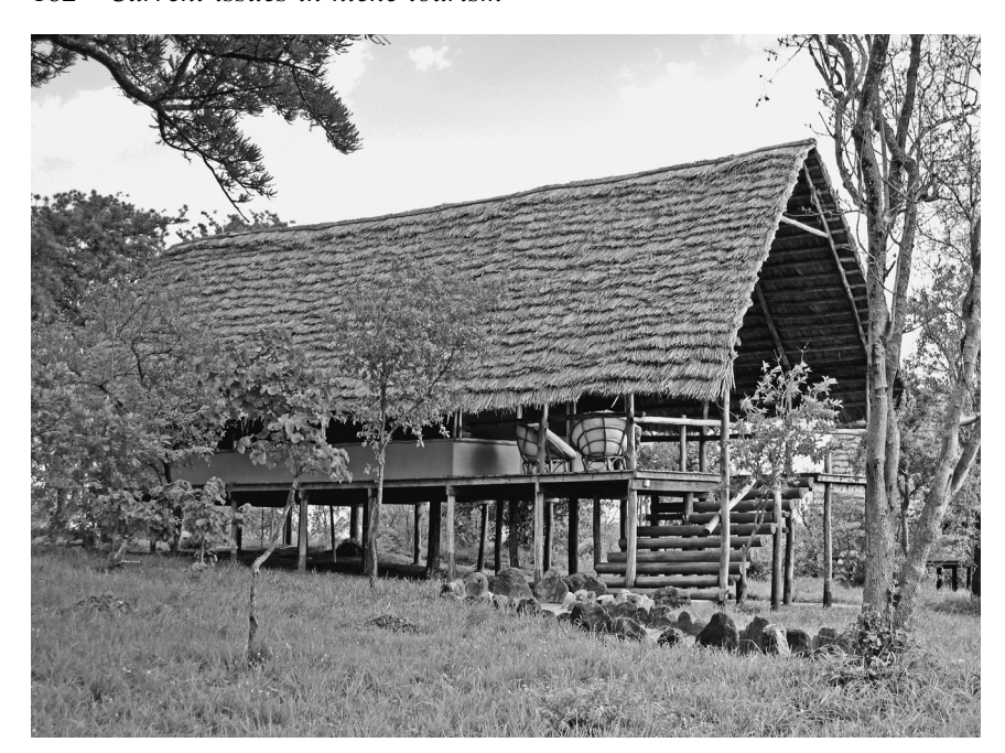
Figure 7.1 Type of accommodation in the Ngorongoro crater area (Tanzania)