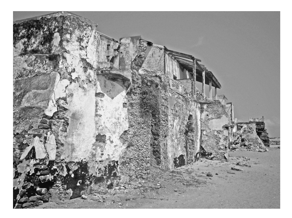
Figure 5.7 Decaying architecture of Fort Prinzensten at Keta

Van Dantzig (1980: vii) claimed that 'tradeports, fortified or not, have been built in various parts of the world, but nowhere in such great numbers along such a relatively short stretch of coast' as in Ghana. Certainly, European trade posts had been common in the world regions, but what distinguishes this tiny strip of coast, from Half Assini in the west to Keta in the east, is unimaginable. The presence of European-built lodges, forts and castles in this region makes it difficult to deny the essential roles that these sites and those who built them have played in the life of local people, diasporic Africans and the world. In fact, the outcome of their presence can still be felt and seen when one examines the aesthetic and architectural designs of these places, the history, and multiple services that they provided for global gold and slave trading within the local communities. Traces of their creators – the Dutch, the Scandinavian, the British, the Brandenburg-Prussians, the Portuguese and the French (Anguandah, 1999) are still visible in the region today. For example, Figure 5.8 shows a plaque placed on the wall of Fort Prinzenstein at Keta narrating the involvement of the Danish-Norwegians in the slave and goods trade that characterised the region, and the significant roles played by these sites between the sixteenth and nineteenth centuries, which more recently became the basis of its