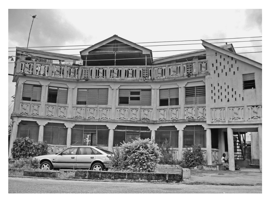
Figure 5.5 Example of decaying Brazilian architecture