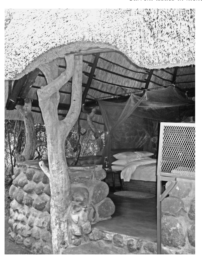
Figure 7.2 Type of accommodation in rhinoceros conservation area (Swaziland)

Cultural tourism has been widely defined and debated (McKercher and Du Gros, 2002; Smith, 2009), but for the purpose of this study, the definition by Richards (2001b:7) that 'cultural tourism covers not just the consumption of the cultural products of the past, but also of contemporary culture or the way of life of a people or region', seemed the most appropriate. Proponents of cultural tourism argue that it is a multi-million dollar industry that accounts for over 40 per cent of international travel (Richards and van der Ark, 2013). In less developed countries, it can help rejuvenate destinations in decline, such as inner cities, through promoting township tourism, for example (Rogerson, 2004), or avoiding the seasonality of primary destinations through the introduction of cultural tourism in less popular destinations (Cuccia and Rizzo, 2011). Cultural tourism can stimulate sustainable tourism development, by enabling communities to become empowered as both owners of the tourism