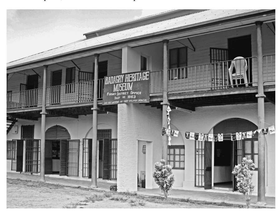
Figure 5.1 Badagry Heritage Museum (former District Officer's office)