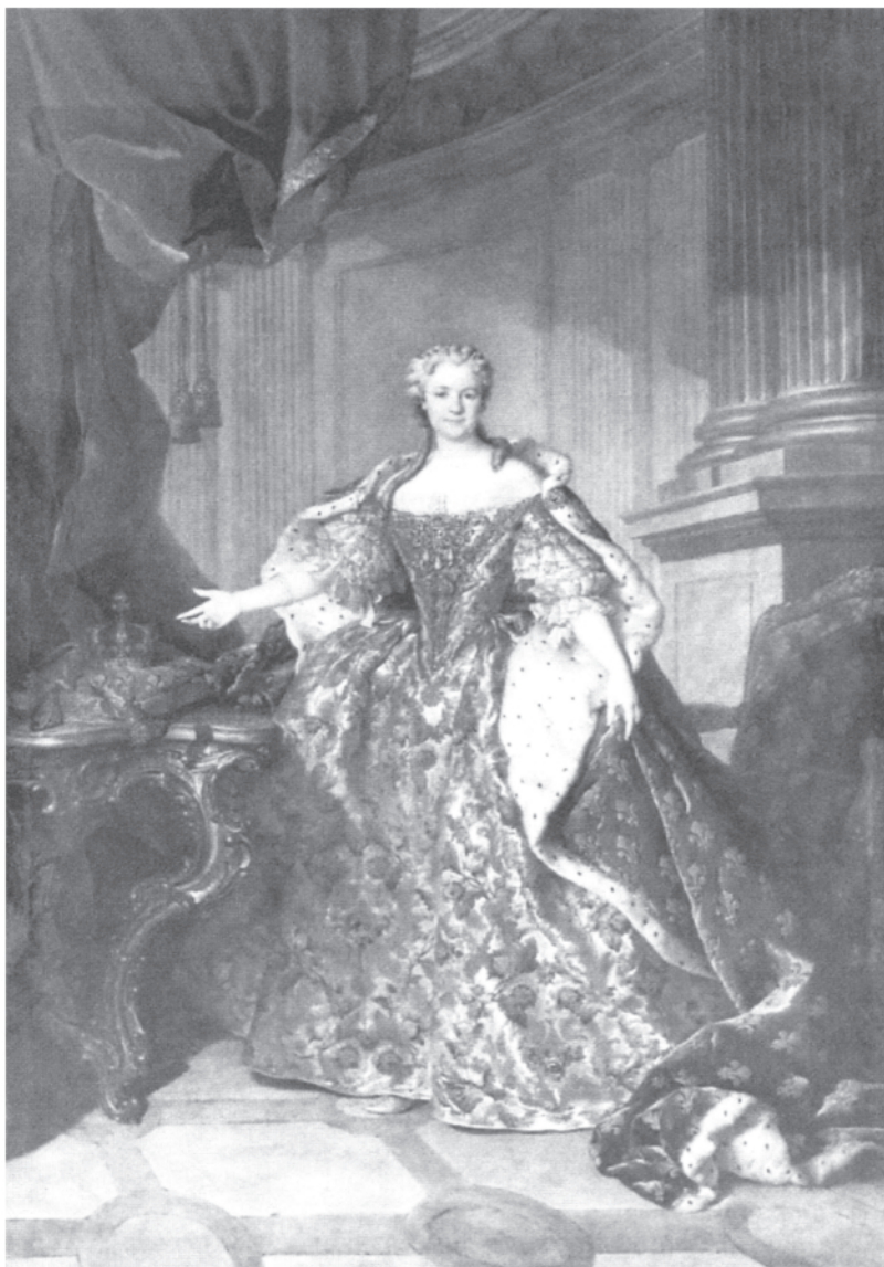
Figure 6.1 Louis Tocqué, Portrait de Marie Leszcynska