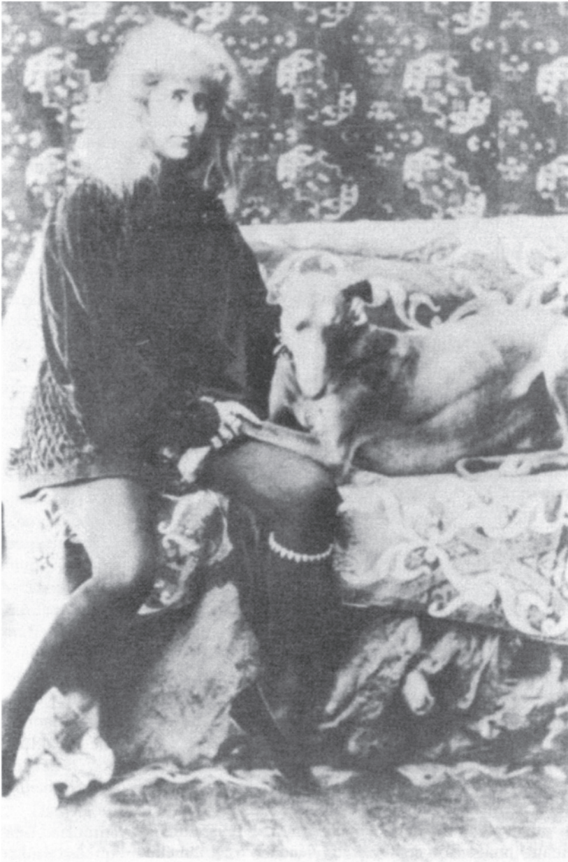
Figure 11.3 Natalie Barney as a Hamlet-like page