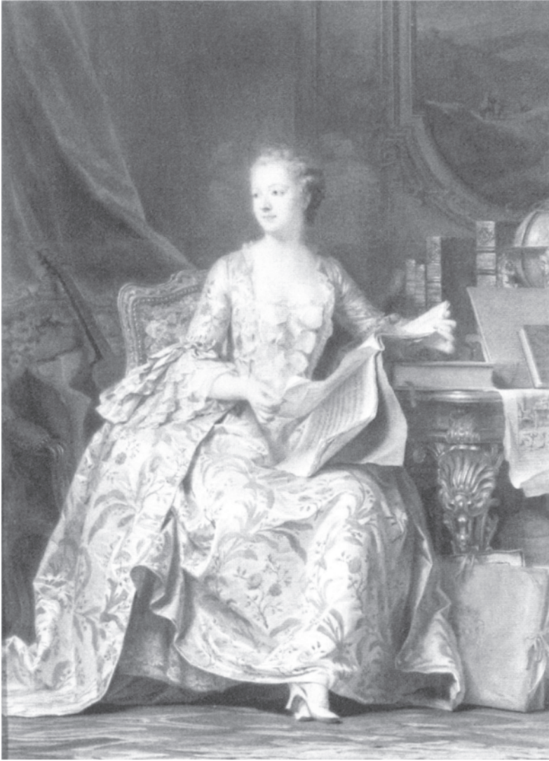
Figure 6.2 Maurice Quentin de La Tour, Portrait de la marquise de Pompadour