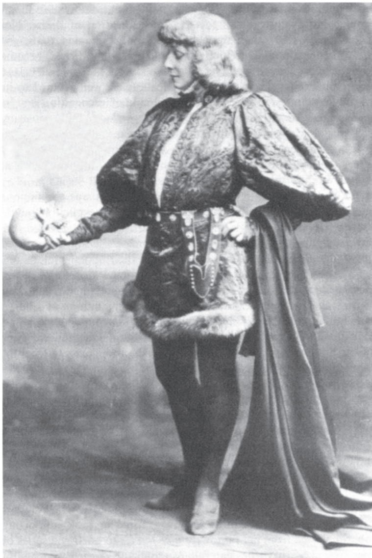
Figure 11.1 Sarah Bernhardt as Hamlet

Bernhardt was a favourite among the growing coterie of fin-de-siècle Paris lesbians. The American heiress, Natalie Barney (1876–1972), addressed a poem to Bernhardt after seeing her in L'Aiglon . The poem was published in 1900 as part of a collection of lesbian verse; as if to highlight her close identification with the Duke, Barney included a portrait of herself as a page. Her outraged father had the plates and all copies destroyed,