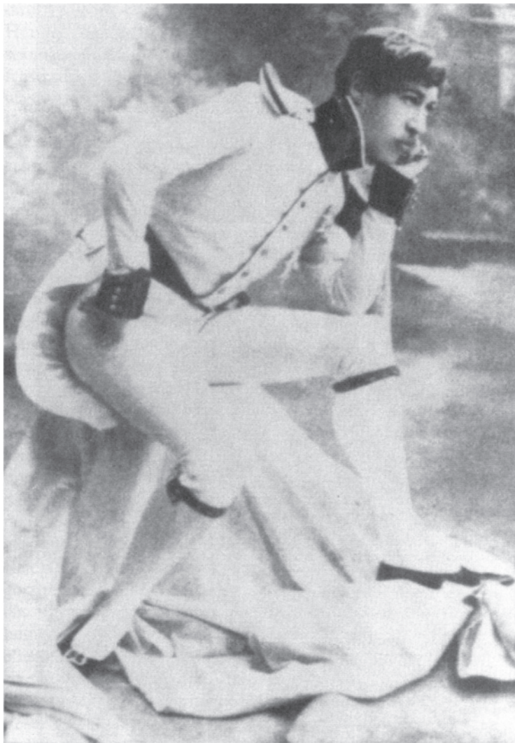
Figure 11.4 The Marquis of Angelsey as the Duke of Reichstadt