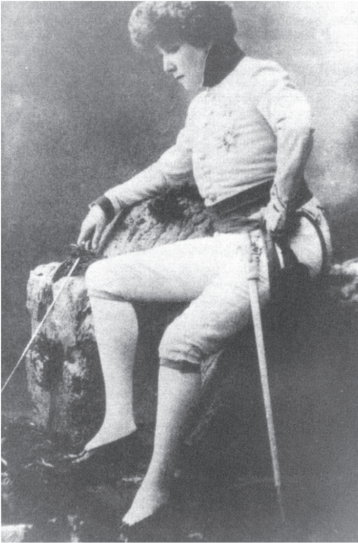
Figure 11.2 Sarah Bernhardt as the Duke of Reichstadt