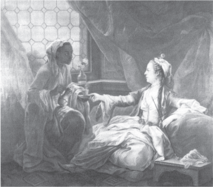
Figure 6.3 Carle Vanloo, Une sultane prenant du café