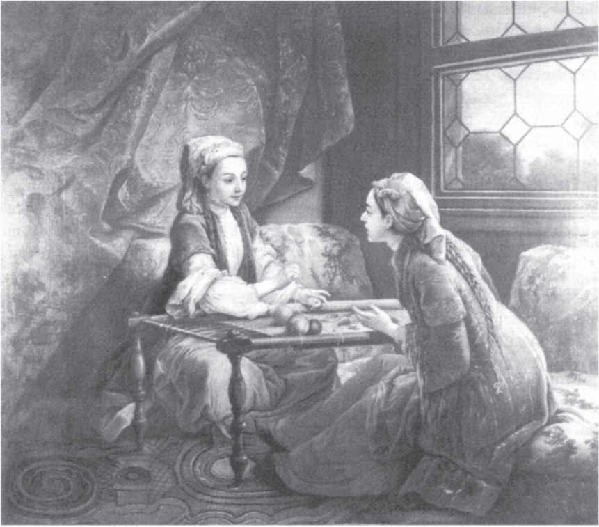
Figure 6.4 Carle Vanloo, Deux sultanes travaillant à la tapisserie