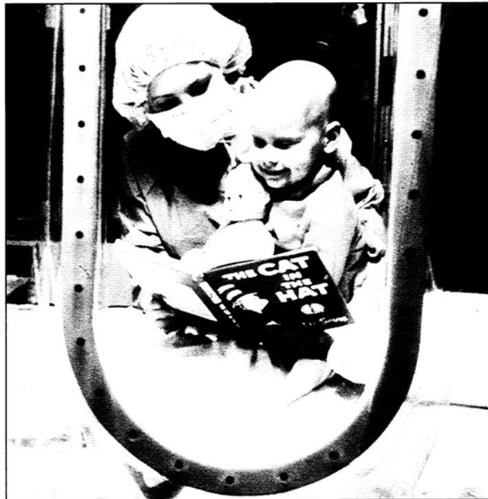
A nurse reads to a child in a laminar airflow unit used to protect people with suppressed immune systems. In this germ-free environment, air flows out one way and germs cannot reenter the system.

These are substantial costs, but even more significant are the long-term costs. If research is slowed, human health will suffer—maybe not immediately, but at some point in the future. New treatments for cancer, Alzheimer's disease, AIDS, and heart disease, new antibiotics and vaccines, ways to regenerate damaged nerve and brain cells, treatments for mental disorders, and a host of other therapies and advances will be delayed or may not occur at all if animal research is curtailed. These are the very real costs that must be taken into account in considering animal research.