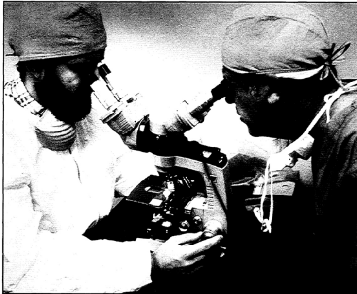
A surgeon and a pathologist use a double-headed microscope to check for the presence of cancer cells in biopsy tissue.

The other major federal law governing animal research is the Health Research Extension Act of 1985, which transformed into law many of the provisions contained in the Public Health Service Policy on Humane Care and Use of Laboratory Animals. This policy requires compliance with a number of other laws, regulations, and guidelines, including the Animal Welfare Act, and establishes procedures that researchers must follow to assure the government that they are in compliance. It applies to investigators funded by the Public Health Service, which includes the National Institutes of Health, the Food and Drug Administration, the