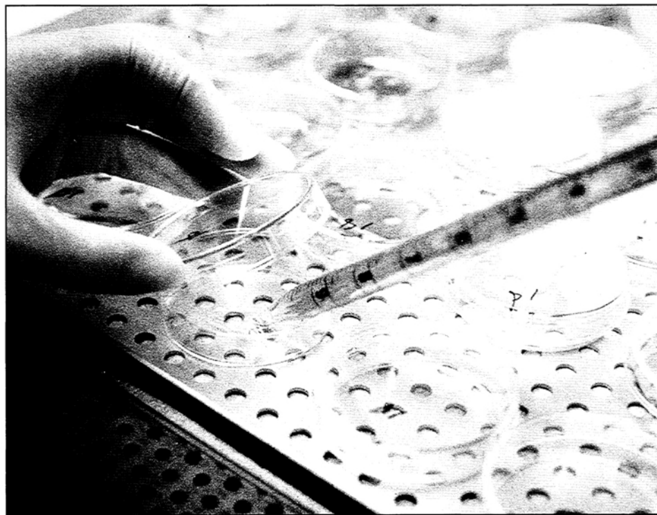
A technician pipets into a culture dish used to test the effects of chemicals on cultured hamster embryo cells.

New experimental procedures can sometimes reduce the numbers of animals used, particularly in the testing of new compounds for toxicity. For instance, new chemical compounds are now routinely screened in cell cultures, and if they are found to be toxic they are not given to animals. But cell cultures cannot replace animals. If a compound proves innocuous in a cell culture, it must still be tested in an animal to gauge its effects in a complex organism. Similarly, computer models and other nonanimal alternatives can at most supplement, rather than replace, animal experimentation.