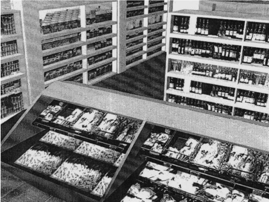
Figure 7.2 Virtual supermarkets.

for example. Learning tasks are attempted in it. As the user becomes more familiar with the tasks, more complex worlds can be substituted. In fact, there are many ways in which the designer can manipulate the virtual world to provide graded assistance to learners.