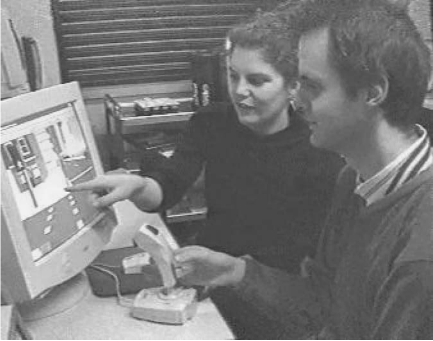
Figure 7.1 Using virtual environments.

environments in addition to those shared with other forms of computer-delivered education, which make them particularly appropriate for people with learning difficulties. First, virtual environments create the opportunity for people with learning difficulties to learn by making mistakes but without suffering the real, humiliating or dangerous consequences of their errors. People with learning difficulties are often denied real-world experiences that might promote their further development because their carers are apprehensive of the consequences of allowing them to do things on their own. Accompanied visits to a real environment sufficient to learn a skill may be impossible to arrange. However, in the virtual environment they can go where they like – even if their mobility is restricted.