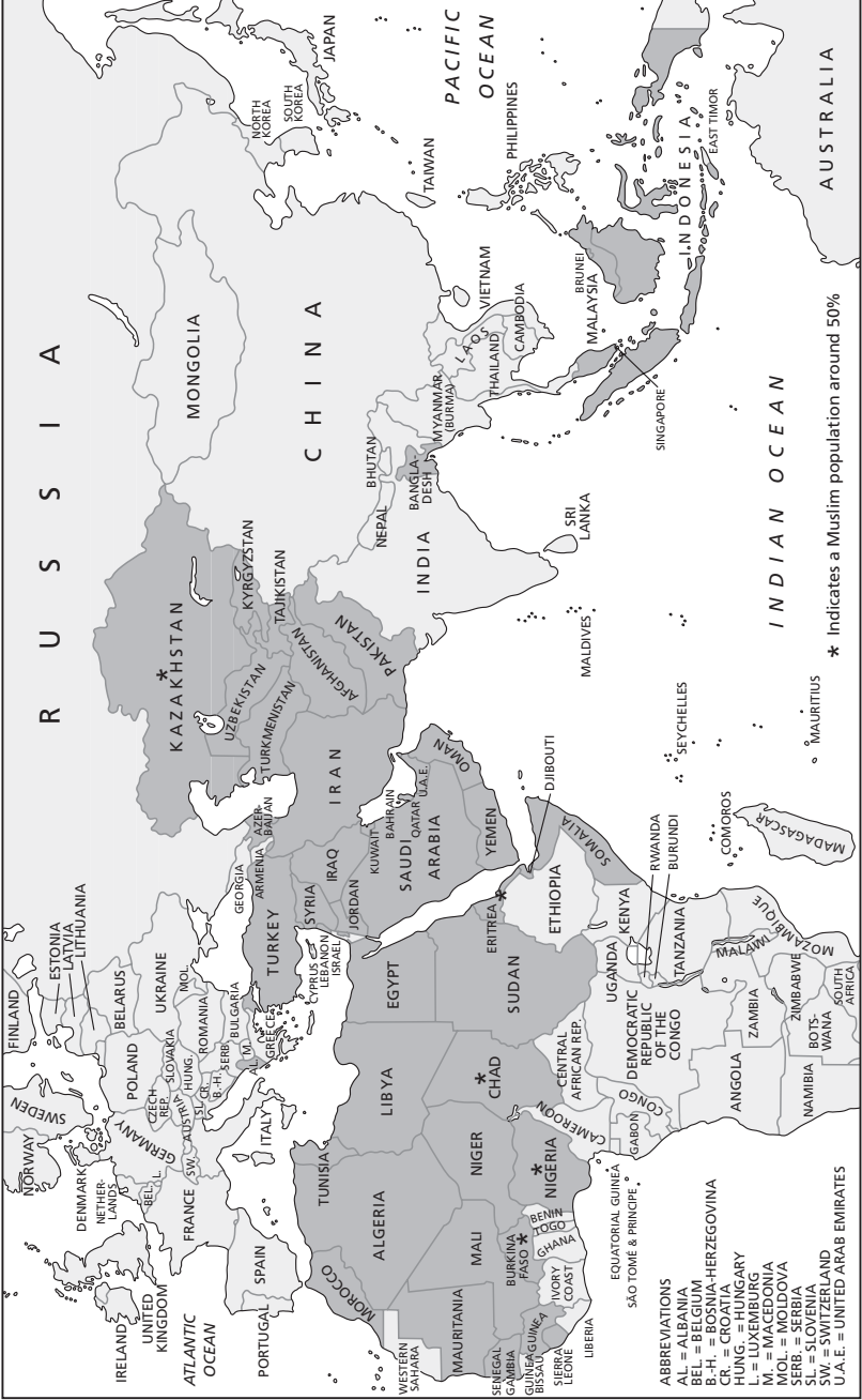
Map 1 Countries with majority Muslim populations