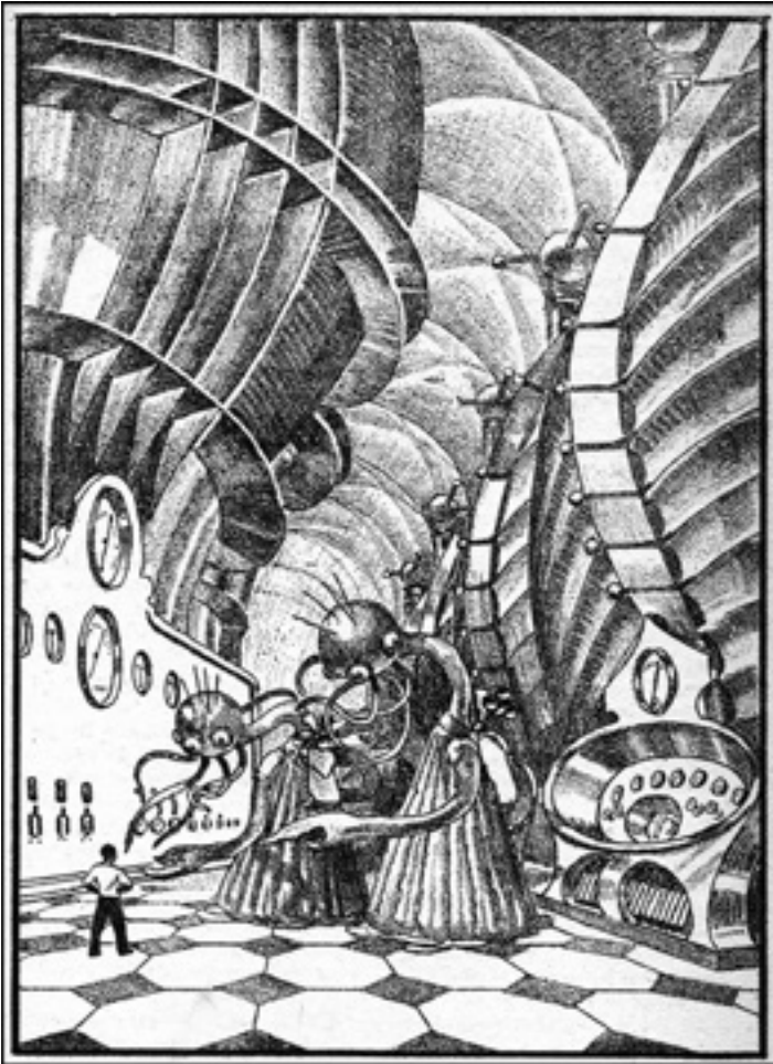
FIGURE 5.1 Einstein's theory of relativity left man adrift in a strange universe of an unimaginable scale, where the familiar notions of space and time broke down and the laws of nature seemed to run amok beyond our parochial corner of the galaxy. This sense of dislocation inspired a considerably less optimistic genre of science fiction, such as the work of H. P. Lovecraft illustrated above, where sentient fungi manipulated life on Earth, tentacled monstrosities waited to consume the stars, and grasping the true nature of existence could drive one to insanity. Although less hostile to the principles of relativity than Paul Weyland, Lovecraft did nevertheless share his rampant anti-Semitism, which seems to have been a recurring theme amongst the theory's commentators.