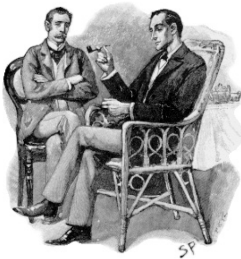
FIGURE 4.1 “Bollocks,” replied Watson.