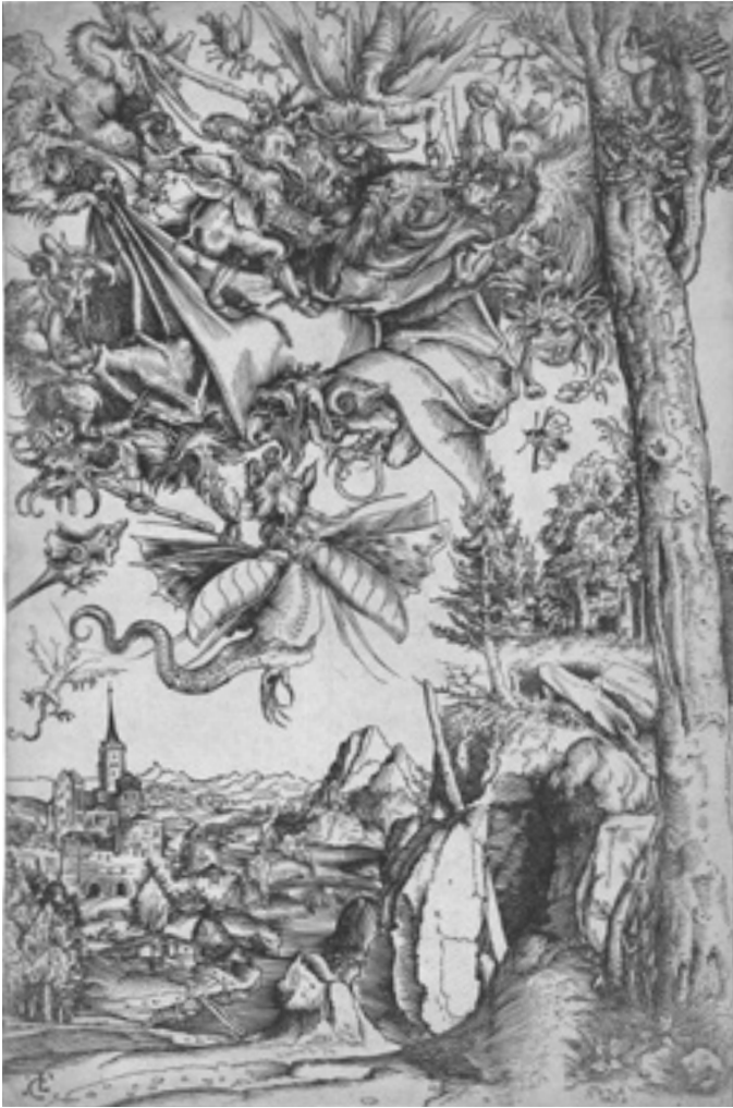
FIGURE 6.1 A famous philosopher of science once summed up his entire position to me with the above illustration of the Temptation of St. Anthony. The point was that we can happily accept that St. Anthony was a real individual, and that he suffered various torments in the desert, while treating the fabulous beasts and demons lifting him into the air as largely illustrative. In much the same way, we can happily endorse parts of our scientific theories—the claims about observable phenomena, the underlying mathematical equations—while similarly withholding belief in some of the more esoteric theoretical detail in which they are presented.