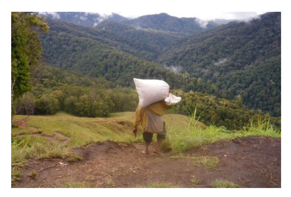
Plate 1 Coffee often has to be carried long distances to market in the PNG highlands

those isolated by rugged terrain (Plate 1) is very difficult and costly to the point that livelihood options are severely curtailed. Often migration to urban and rural resource development sites is the only viable option for people from these communities. Indeed, migrants from remote, poorly serviced and disadvantaged rural areas and small islands constitute a high proportion of the growing urban population (Koczberski et al. 2001; Storey 2010; Curry et al. 2012; Numbasa and Koczberski 2012).