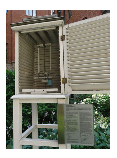
Fig. 1 Stevenson's box

climate records relied on manual plotting of temperature, rainfall and pressure data collected from mostly volunteer recorders who used telephone, telegraphic signals and ground transportation to the nearest telephone device. Scattered around the globe the Stevenson's box (see Fig. 1) symbolizes the links between land, communications and human activity. Automated readings from ground fixtures are the major change of recent times. Nowadays global networks share information disseminating from weather stations into websites around the world without interruption.