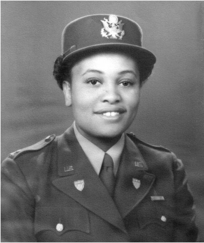
Proudly serving as an army recruiter in Ohio during World War II, as one of the first forty black women selected by Dr. Mary McLeod Bethune for officer training in the newly created Women's Army Auxiliary Corps.