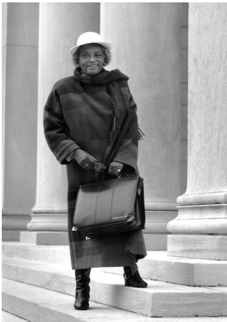
Outside the U.S. District Court for the District of Columbia, circa 1985.