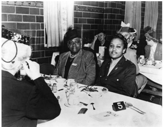
With Dr. Bethune at a WAAC luncheon, circa 1944.